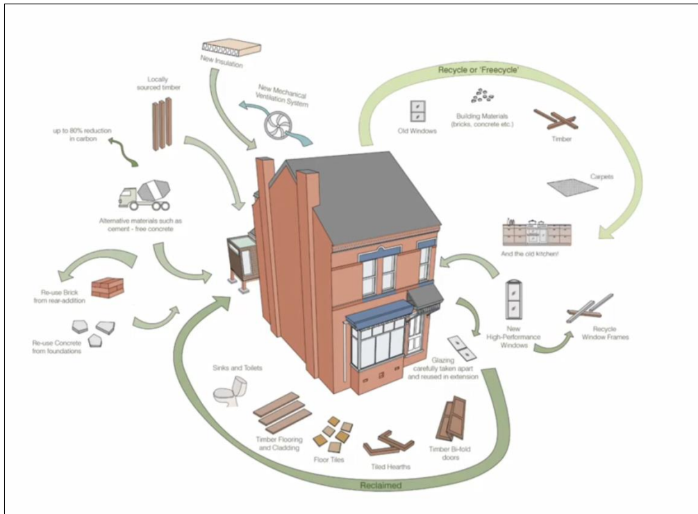
Strategies of waste minimisation, reuse, re/freecycling and low carbon specification (Arboreal Architecture)