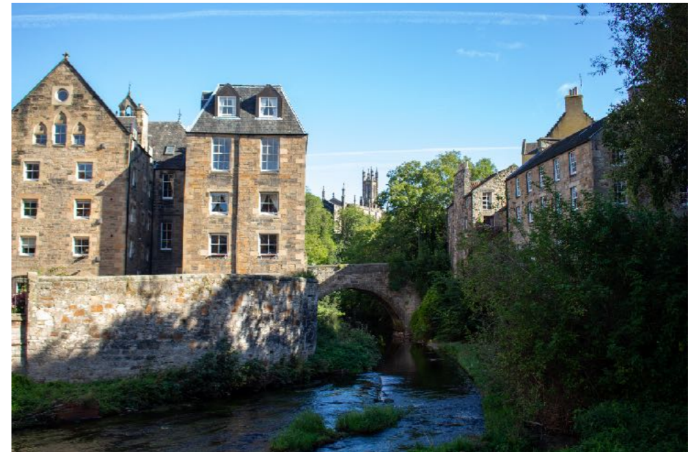
Edinburgh - Kirsten Drew