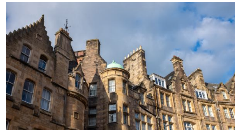
Edinburgh - gunnar-ridderstrom